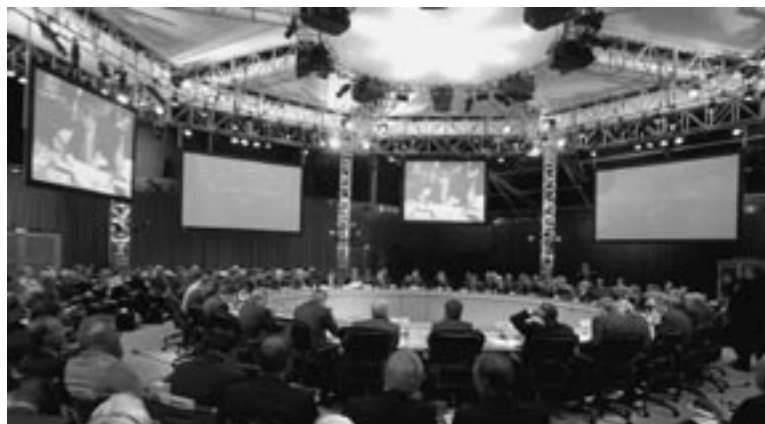
NATO Defense Ministers taking part in Dynamic Response 2007, a war game dubbed "crisis management seminar," at the Joint National Integration Center of Schriever Air Force Base, near Colorado Springs, Colorado, in October 2003. This was the first NATO meeting that included its civilian and military sides in a joint exercise.

These contradictions could be brushed under the rug as long as the United States (and by extension NATO) could credibly claim that it was making progress towards the fulfillment of its nuclear disarmament obligations. Prior to 1999, the United