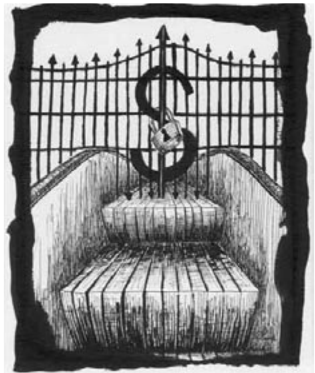
ALMA CHANEY, WWW.ALMACHANEY.COM

SEE DEMOCRATIZING MONEY ON PAGE 8 ENDNOTES, PAGE 11–12